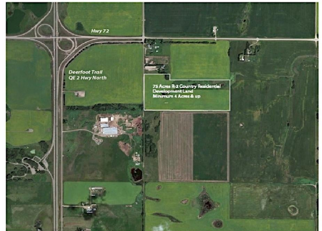
Subject Property 75.07 Acres

75 Acres in MD of Rockyview, a Great INVESTMENT Opportunity, the perfect place to build your dream home, Minutes from Booming Airdrie, Balzac Mega Mall, and 15 minutes from Calgary City Limits. It is Currently Zoned R-RUR / A-SML. With county approval, you may be able to subdivide into 9-15 Parcels. A minimum of 4-acre parcels each and one 13-acre parcel for your dream home. This Beautiful parcel of rolling land offers unobstructed Mountains, partial Calgary views, and a pond. This location has easy access just off Hwy QE2 easy. Minutes from the Cross Iron Mills Shopping Centre in Balzac. Already Zoned for R-RUR / A-SML. The land could be rented to a local farmer. for $95 per acre. Don't Miss this Opportunity!!!!