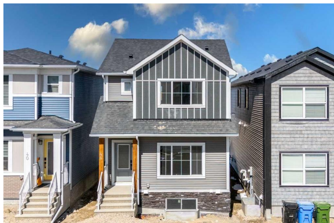
44 Lewiston Dr NE, Calgary, AB

Welcome to Your Dream Home- Presenting an exceptional opportunity to own a brand new, two-story home in the sought-after community of Lewisburg. Designed for modern living, this stunning residence seamlessly blends elegance, functionality, and comfort. Upon entering, youâ€™ll be greeted by an abundance of natural light and an open-concept layout that effortlessly connects the inviting family room, illuminated living room, and stylish kitchen. Luxury vinyl plank flooring flows throughout the main level, offering both durability and timeless appeal. This home surpasses standard builder specifications with premium upgrades, including sleek cabinetry, elegant interior doors, designer light fixtures, and sophisticated quartz countertops in the kitchen and bathrooms. Every detail has been carefully curated for refined living. Upstairs, discover three generously sized bedrooms, each offering comfort and charm. The primary suite is a true retreat, featuring a spacious layout, a double vanity, and a separate shower. The unfinished basement presents a versatile space with a separate exterior entrance and a bathroom rough-in- ideal for future development as a legal suite. Your vision can easily come to life. Step outside to the backyard with a large deck, perfect for entertaining or relaxing. Located near the parks, pathways, and recreational facilities, with access to schools, child care, and future educational developments. Schedule Your