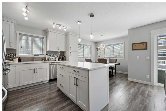
208 EVANSTON MANOR NW REALTORS ASSOCIATION OF CALGARY ENTRY LEVEL (AG) - 323.41 Sq Ft / 30.04 m² ENTRY LEVEL UNDEVELOPED (AG) - 42.62 Sq Ft / 3.96 m² MAIN LEVEL (AG) - 906.61 Sq Ft / 84.35 m² UPPER LEVEL (AG) - 662.09 Sq Ft / 61.51 m² TOTAL ABOVE GRADE RMS SIZE - 1634.73 Sq Ft / 151.86 m²

** NO GST PAYABLE ON THE PREOWNED HOME ** Beautifully curated, Almost Brand New Feel, and immaculately maintained by the original owner ** INDOOR PARKING - HEATED ATTACHED GARAGE plus secondary OUTDOOR PARKING PAD ** This trendy air-conditioned 3-story 1630+ SF townhome is ideally located in the community of Evanston and close to the many amenities - transit, parks, shopping, pathways, dog parks, daycare in complex and FUN! The ground floor features a sizable main entrance, a bonus room, storage, a utility closet, a wide hallway, and convenient access to your garage. The spacious upper main living area includes beautiful laminate wood plank flooring, a large living room, a laundry room, a stylish kitchen with quartz counter tops/upgraded tile kitchen backsplash/shaker style classic white cabinets with trims/under mount sink with window above/upgraded stainless steel appliances (gas stove cooktop, OTR microwave, quiet dishwasher, french door fridge with front water dispenser). A sizeable outdoor balcony is off the family-approved living room and offers a BBQ area with a gas line. The upper floor features three good-sized bedrooms and two full bathrooms. BONUS: The primary bedroom layout features a private en-suite and a large walk-in closet. This trendy townhome features a modern décor palette and offers everything you need, with a functional yet stylish design. A possession date of July 31, 2025, is available! Call your friendly REALTOR(R) to